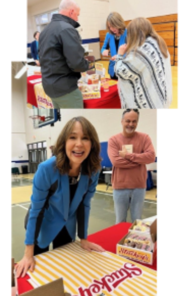
Stucky's Branding Rocks!!