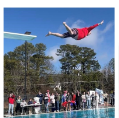
District Governor Belly Flop King at Polar Plunge