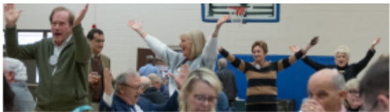
Dancing to Get the Meeting Started