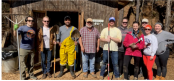
The Roswell Rotary After Hours Club working on the Unity Garden at the Chattahoochee Nature Center.

Roswell Rotary supports environmental sustainability through its After Hours Club, which repurposes plastic grocery bags to aid produce transport from the Chattahoochee Nature Center's Unity Garden to the North Fulton Community Charities local food pantry. The group also actively participates in Georgia's annual "Sweep the Hooch" river cleanup and other city park beautification projects.